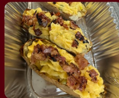
Twice Baked Potatoes